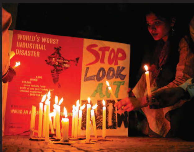
The struggle for justice goes on...

24 years later, people are still fighting for justice: for safe drinking water, for health-care facilities and jobs for the people poisoned by UC. They also demand that Anderson, the UC chairman who faces criminal charges, be prosecuted.