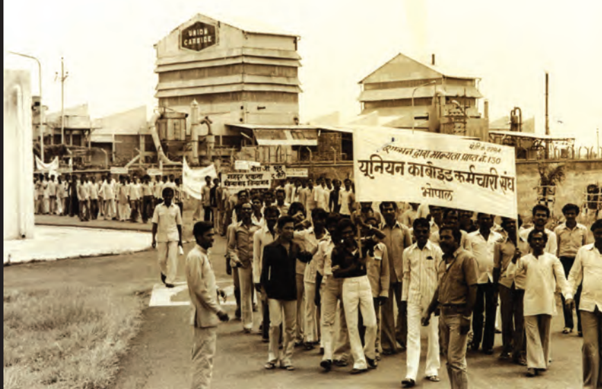
Members of UC Employees Union protesting

The disaster was not an accident. UC had deliberately ignored the essential safety measures in order to cut costs. Much before the Bhopal disaster, there had been incidents of gas leak killing a worker and injuring several.