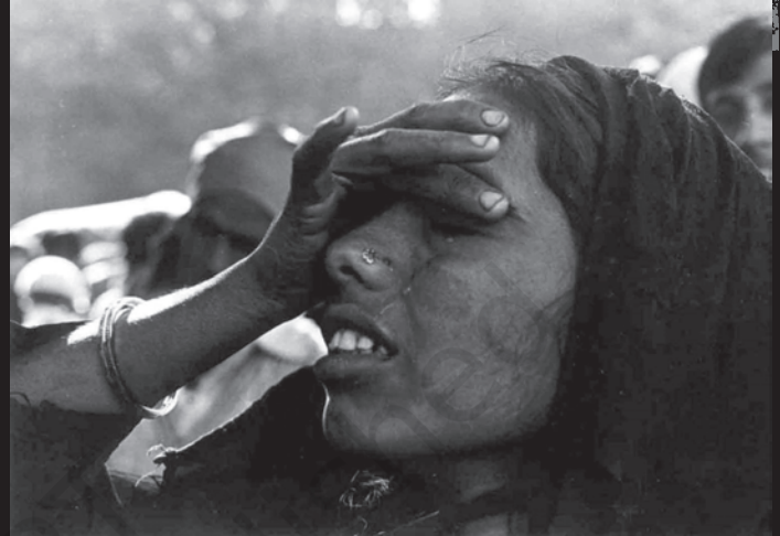
The next morning