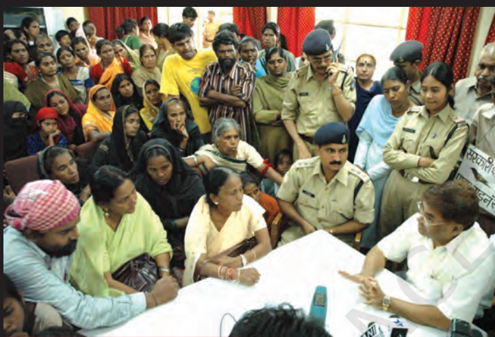
Gas victims with the Gas Relief Minister

Despite the overwhelming evidence pointing to UC as responsible for the disaster, it refused to accept responsibility.