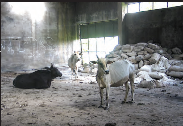
Bags of chemicals lie strewn around the UC plant

UC stopped its operations, but left behind tons of toxic chemicals. These have seeped into the ground, contaminating water. Dow Chemical, the company who now owns the plant, refuses to take responsibility for clean up.