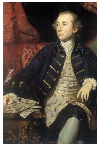
Fig. 3 – Warren Hastings became the first Governor-General of India in 1773

Mill thought that all Asian societies were at a lower level of civilisation than Europe. According to his telling of history, before the British came to India, Hindu and Muslim despots ruled the country. Religious intolerance, caste taboos and superstitious practices dominated