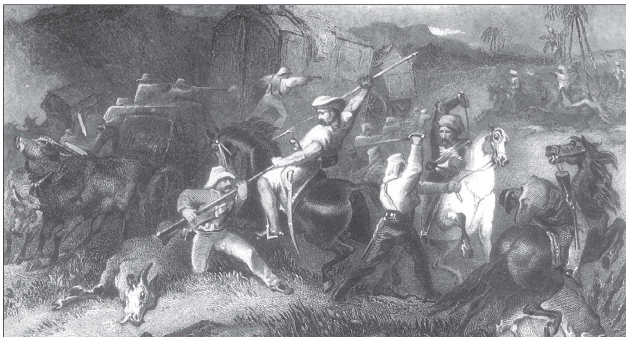
Fig. 4 – The battle in the cavalry lines

On the evening of 3 July 1857, over 3,000 rebels came from Bareilly, crossed the river Jamuna, entered Delhi, and attacked the British cavalry posts. The battle continued all through the night.