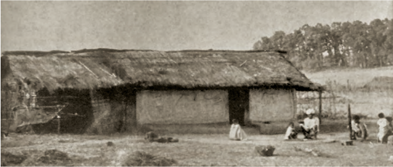
Fig. 13 – A village in Central India where the Agarias – a community of iron smelters – lived.

Some communities like the Agarias specialised in the craft of iron smelting. In the late nineteenth century a series of famines devastated the dry tracts of India. In Central India, many of the Agaria iron smelters stopped work, deserted their villages and migrated, looking for some other work to survive the hard times. A large number of them never worked their furnaces again.