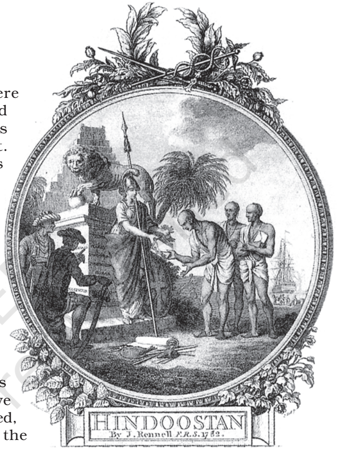
Fig. 1 – Brahmins offering the Shastras to Britannia, frontispiece to the first map produced by James Rennel, 1782

Look carefully at Fig.1 and write a paragraph explaining how this image projects an imperial perception.