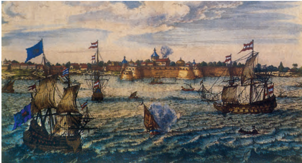
Fig. 1 – Trading ships on the port of Surat in the seventeenth century

Surat in Gujarat on the west coast of India was one of the most important ports of the Indian Ocean trade. Dutch and English trading ships began using the port from the early seventeenth century. Its importance declined in the eighteenth century.