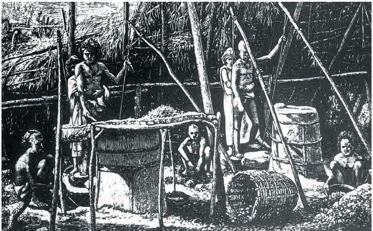
Fig. 12 – Iron smelters of Palamau, Bihar

Bellows – A device or equipment that can pump air