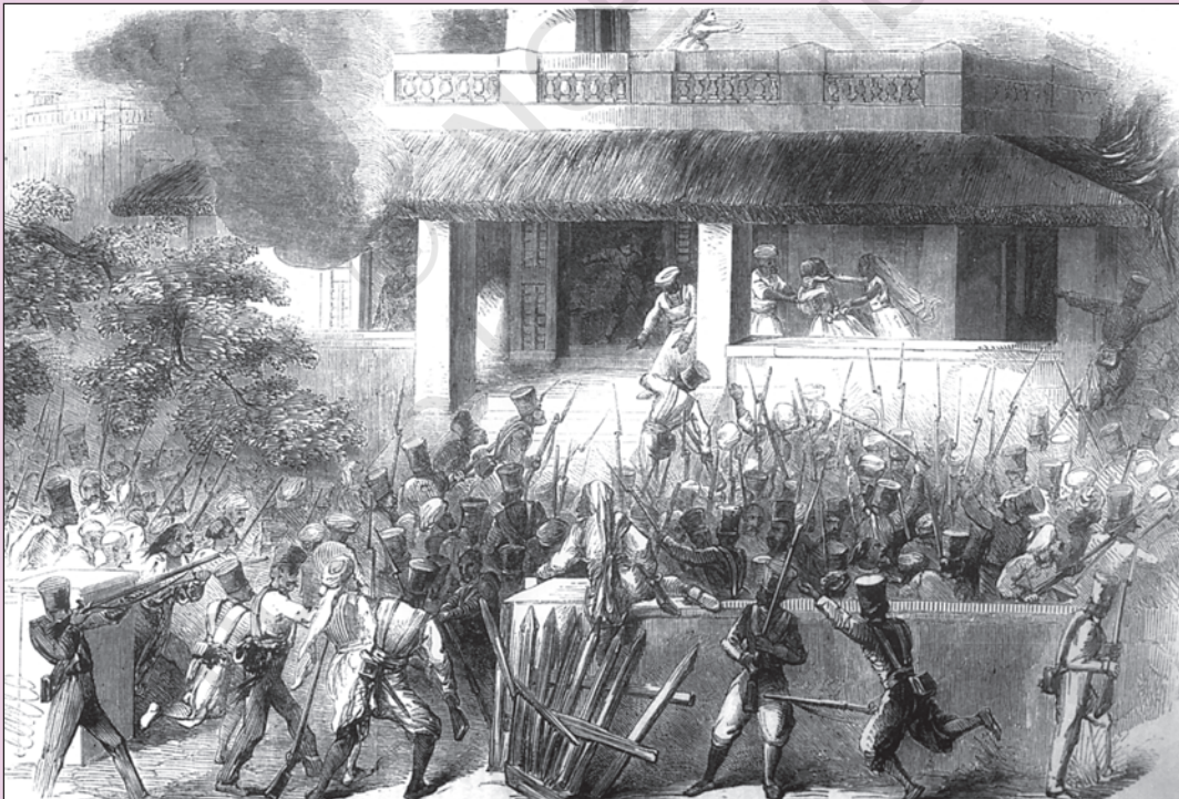
Fig. 3 – Rebel sepoys at Meerut attack officers, enter their homes and set fire to buildings

It is my humble opinion that this seizing of Oudh filled the minds of the Sepoys with distrust and led them to plot against the Government. Agents of the Nawab of Oudh and also of the King of Delhi were sent all over India to discover the temper of the army. They worked upon the feelings of sepoys, telling them how treacherously the foreigners had behaved towards their king. They invented ten thousand lies and promises to persuade the soldiers to mutiny and turn against their masters, the English, with the object of restoring the Emperor of Delhi to the throne. They maintained that this was wholly within the army's powers if the soldiers would only act together and do as they were advised.