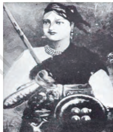
Fig. 7 – Rani Lakshmibai