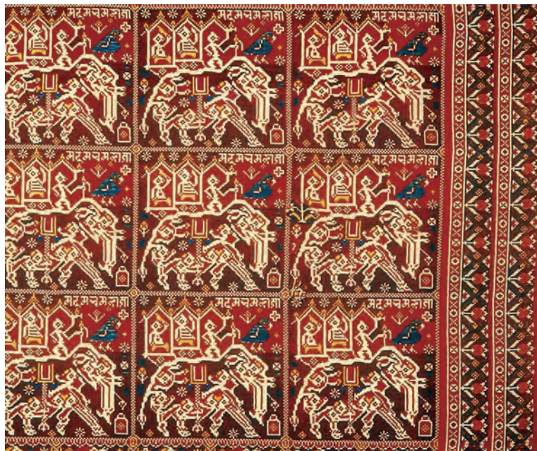
Fig. 2 – Patola weave, mid-nineteenth century

Let us first look at textile production.