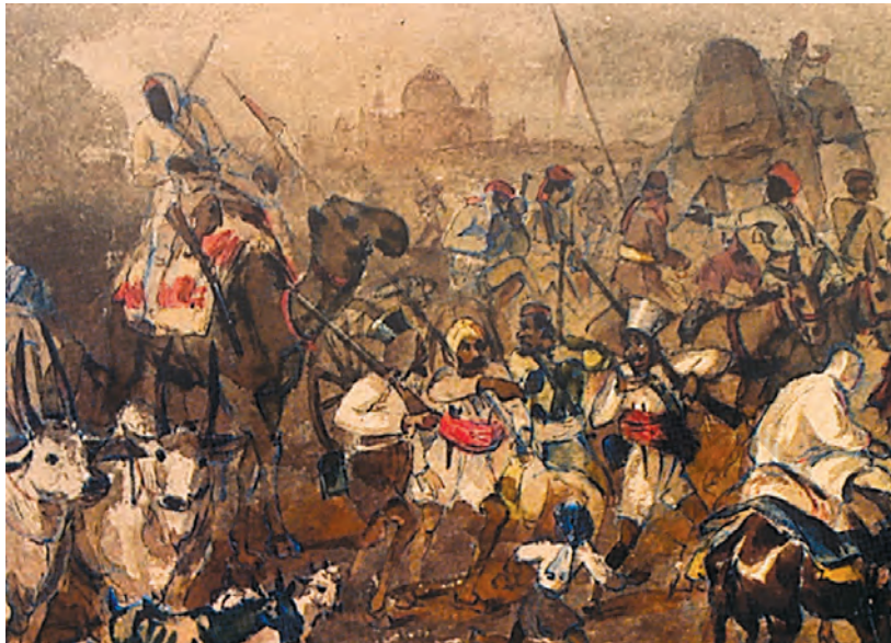
Fig. 1 – Sepoys and peasants gather forces for the revolt that spread across the plains of north India in 1857