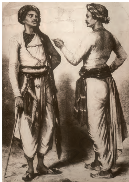
Fig. 2 – Sepoys exchange news and rumours in the bazaars of north India

There were of course other Indians who wanted to change existing social practices. You will read about these reformers and reform movements in Chapter 7.