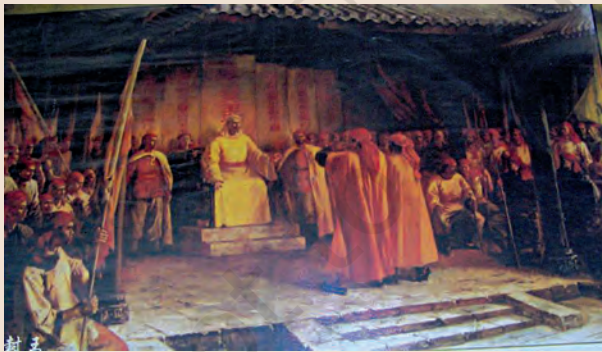
Fig. 16 – Taiping army meeting their leader

While the revolt was spreading in India in 1857, a massive popular uprising was raging in the southern parts of China. It had started in 1850 and could be suppressed only by the mid-1860s. Thousands of labouring, poor people were led by Hong Xiuquan to fight for the establishment of the Heavenly Kingdom of Great Peace. This was known as the Taiping Rebellion.