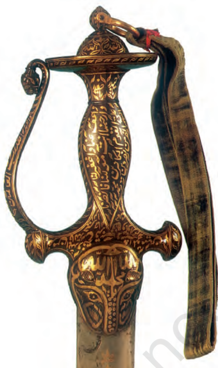
Fig. 11 – Tipu's sword made in the late eighteenth century

Smelting – The process of obtaining a metal from rock (or soil) by heating it to a very high temperature, or of melting objects made from metal in order to use the metal to make something new