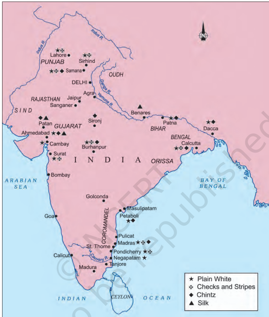
Fig. 8 – Weaving centres: 1500-1750

If you look at the map you will notice that textile production was concentrated in four regions in the early nineteenth century. Bengal was one of the most important centres. Located along the numerous rivers in the delta, the production centres in Bengal could easily transport goods to distant places. Do not forget that in the early nineteenth century railways had not developed and roads were only just beginning to be laid on an extensive scale.