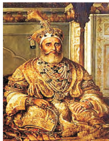
Fig. 6 – Bahadur Shah Zafar

Regiment after regiment mutinied and took off to join other troops at nodal points like Delhi, Kanpur and Lucknow. After them, the people of the towns and villages also rose up in rebellion and rallied around local leaders, zamindars and chiefs who were prepared to establish their authority and fight the British. Nana Saheb, the adopted son of the late Peshwa Baji Rao who lived near Kanpur, gathered armed forces and expelled the British garrison from the city. He proclaimed himself Peshwa. He declared that he was a governor under Emperor Bahadur Shah Zafar. In Lucknow, Birjis Qadr, the son of the deposed Nawab Wajid Ali Shah, was proclaimed the new Nawab. He too acknowledged the suzerainty of Bahadur Shah Zafar. His mother Begum Hazrat Mahal took an active part in organising the uprising against the British. In Jhansi, Rani Lakshmibai joined the rebel sepoys and