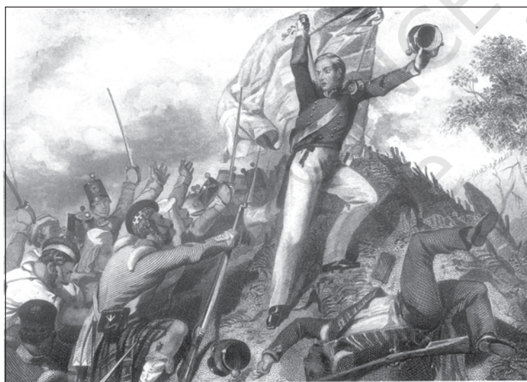
Fig. 15 – British forces capture the rebels near Kanpur

they would remain safe and their rights and claims to land would not be denied. Nevertheless, hundreds of sepoys, rebels, nawabs and rajas were tried and hanged.