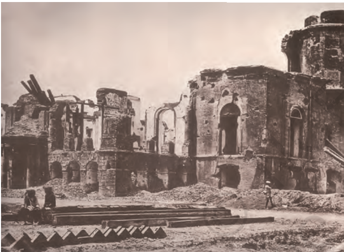
Fig. 17 – Ruins of the Residency in Lucknow

In June 1857, the rebel forces began the siege of the Residency. A large number of British women, men and children had taken shelter in the buildings there. The rebels surrounded the compound and bombarded the building with shells. Hit by a shell, Henry Lawrence, the Chief Commissioner of Awadh, died in one of the rooms that you see in the picture. Notice how buildings carry the marks of past events.