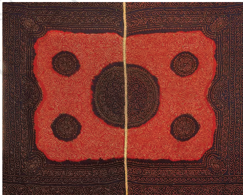
Fig. 6 – Bandanna design, early twentieth century

There were other cloths in the order book that were noted by their place of origin: Kasimbazar, Patna, Calcutta, Orissa, Charpoore. The widespread use of such words shows how popular Indian textiles had become in different parts of the world.