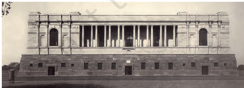
Fig. 4 – The National Archives of India came up in the 1920s

In the early years of the nineteenth century these documents were carefully copied out and beautifully written by calligraphists – that is, by those who specialised in the art of beautiful writing. By the middle of the nineteenth century, with the spread of printing, multiple copies of these records were printed as proceedings of each government department.