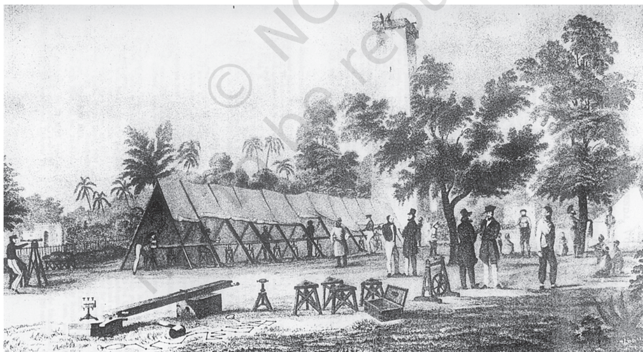
Fig. 6 – Mapping and survey operations in progress in Bengal, a drawing by James Prinsep, 1832

From this vast corpus of records we can get to know a lot, but we must remember that these are official records. They tell us what the officials thought, what