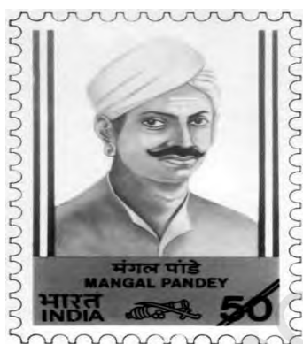
Fig. 5 – Postal stamp issued in commemoration of Mangal Pandey

The sepoy of Meerut rode all night of 10 May to reach Delhi in the early hours next morning. As news of their arrival spread, the regiments stationed in Delhi also rose up in rebellion. Again British officers were killed, arms and ammunition seized, buildings set on fire. Triumphant soldiers gathered around the walls of the Red Fort where the Badshah lived, demanding to meet him. The emperor was not quite willing to challenge the mighty British power but the soldiers persisted. They forced their way into the palace and proclaimed Bahadur Shah Zafar as their leader.