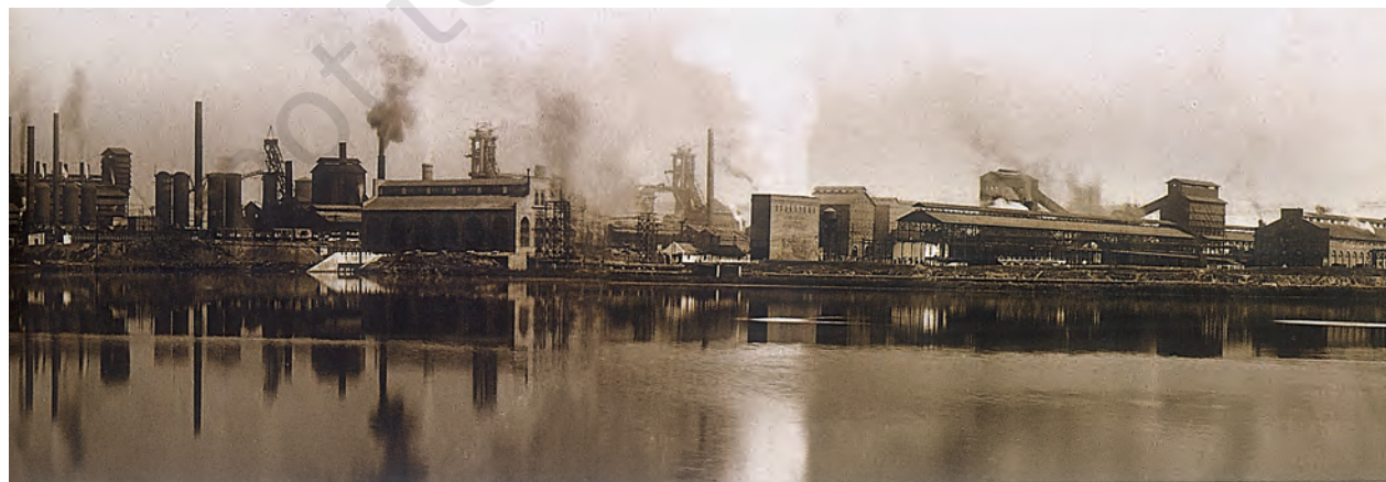
Fig. 14 – The Tata Iron and Steel factory on the banks of the river Subarnarekha, 1940

Slag heaps – The waste left when smelting metal