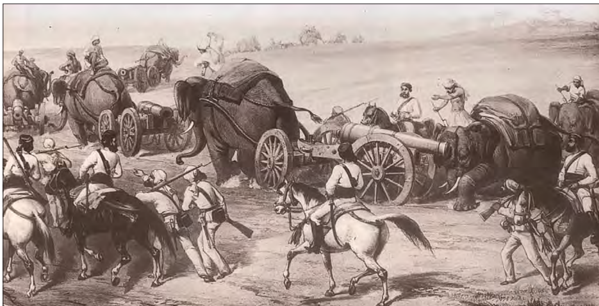
Fig. 12 – The siege train reaches Delhi

The British forces initially found it difficult to break through the heavy fortification in Delhi. On 3 September 1857 reinforcements arrived – a 7-mile-long siege train comprising cartloads of canons and ammunition pulled by elephants.