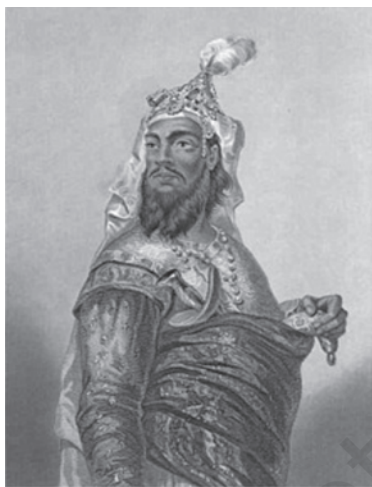
Fig. 10 – A portrait of Vir Kunwar Singh