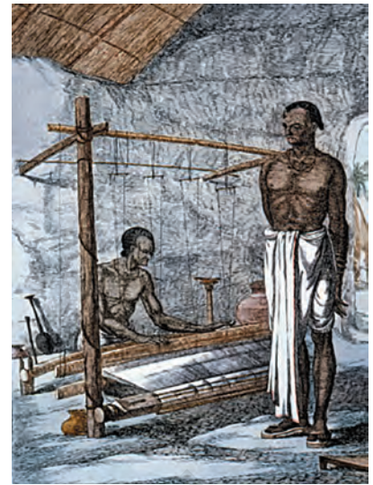
Fig. 9 – A tanti weaver of Bengal, painted by the Belgian painter Solvyns in the 1790s

By the beginning of the nineteenth century, English-made cotton textiles successfully ousted Indian goods from their traditional markets in Africa, America and Europe. Thousands of weavers in India were now thrown out of employment. Bengal weavers were the worst hit. English and European companies stopped buying Indian goods and their agents no longer gave out