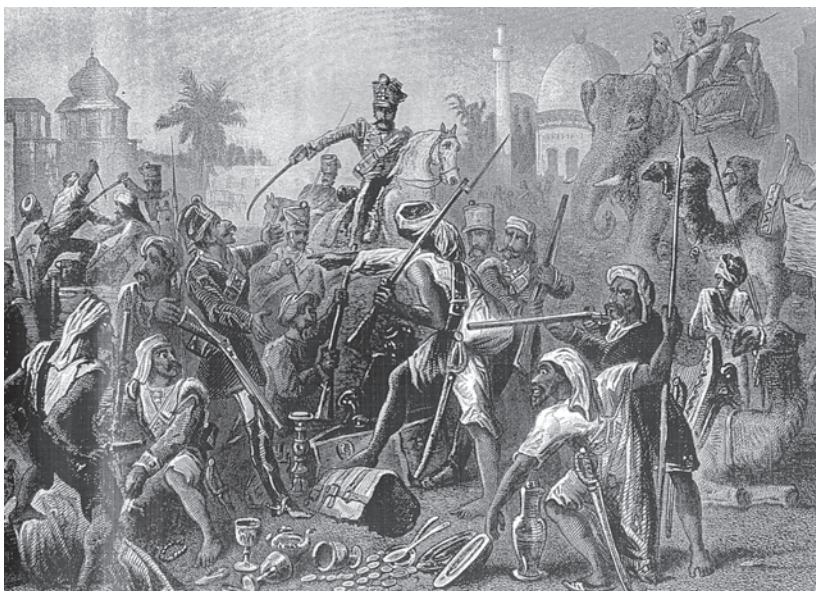
Fig. 7 – The rebels of 1857

Images need to be carefully studied for they project the viewpoint of those who create them. This image can be found in several illustrated books produced by the British after the 1857 rebellion. The caption at the bottom says: “Mutinous sepoys share the loot”. In British representations the rebels appear as greedy, vicious and brutal. You will read about the rebellion in Chapter 5.