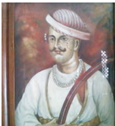
Fig. 9 – A portrait of Nana Saheb