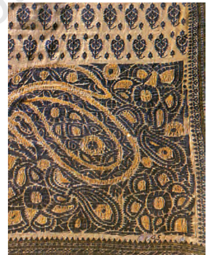
Fig. 4 – Jamdani weave, early twentieth century

Notice how each item in the order book was carefully priced in London. These orders had to be placed two years in advance because this was the time required to send orders to India, get the specific cloths woven and shipped to Britain. Once the cloth pieces arrived in London they were put up for auction and sold.