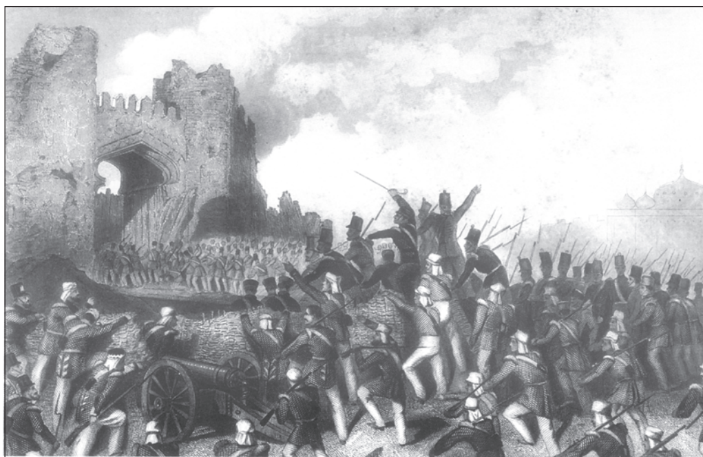
Fig. 14 – British troops blow up Kashmere Gate to enter Delhi

they would remain safe and their rights and claims to land would not be denied. Nevertheless, hundreds of sepoys, rebels, nawabs and rajas were tried and hanged.