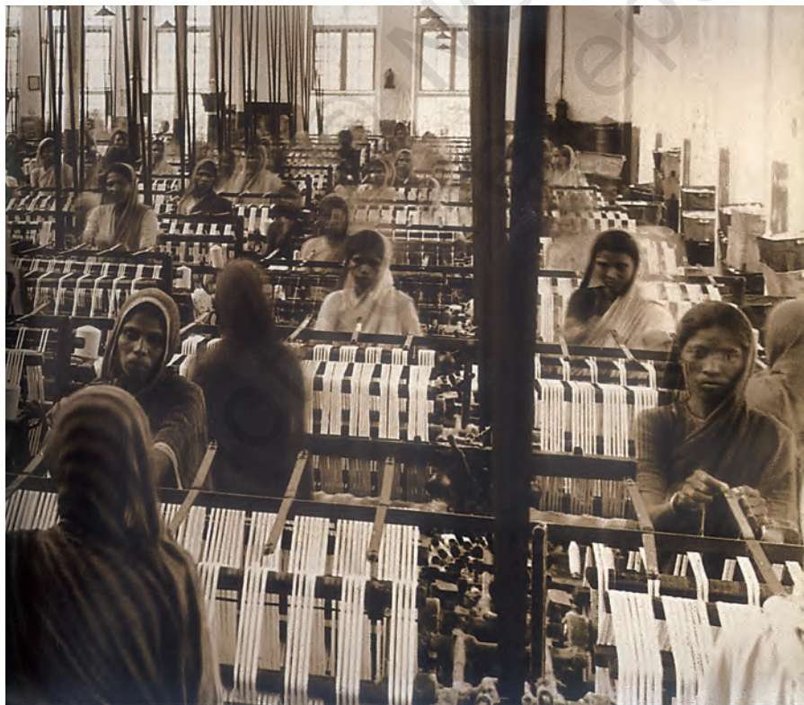
Fig. 10 – Workers in a cotton factory, circa 1900, photograph by Raja Deen Dayal

The first cotton mill in India was set up as a spinning mill in Bombay in 1854. From the early nineteenth century, Bombay had grown as an important port for the export of raw cotton from India to England and China. It was close to the vast black soil tract of western India where cotton was grown. When the cotton textile mills came up they could get supplies of raw material with ease.